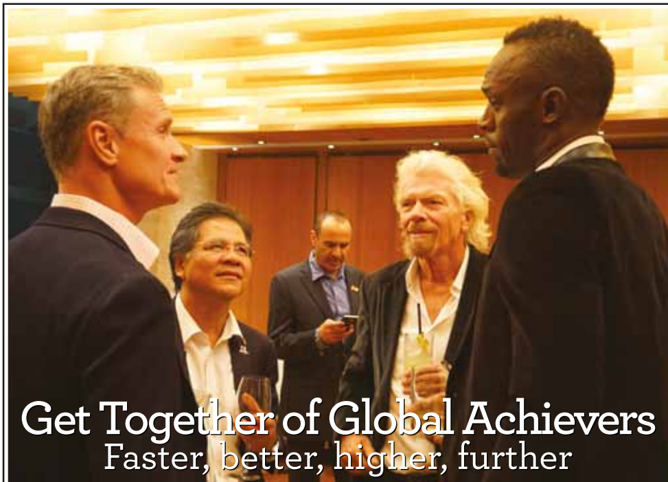
Get Together of Global Achievers Faster, better, higher, further