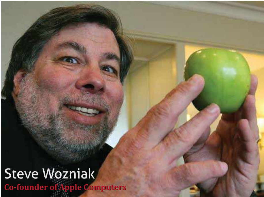
Steve Wozniak Co-founder of Apple Computers

A SILICON VALLEY ICON AND PHILANTHROPIST for more than thirty years, Steve Wozniak has helped shape the computing industry with his design of Apple's first line of products and influenced the popular Macintosh. In 1976, Wozniak and Steve Jobs founded Apple Computer Inc. with Wozniak's Apple I personal computer. The following year, he introduced his Apple II personal computer, which was integral in launching the personal computer industry.